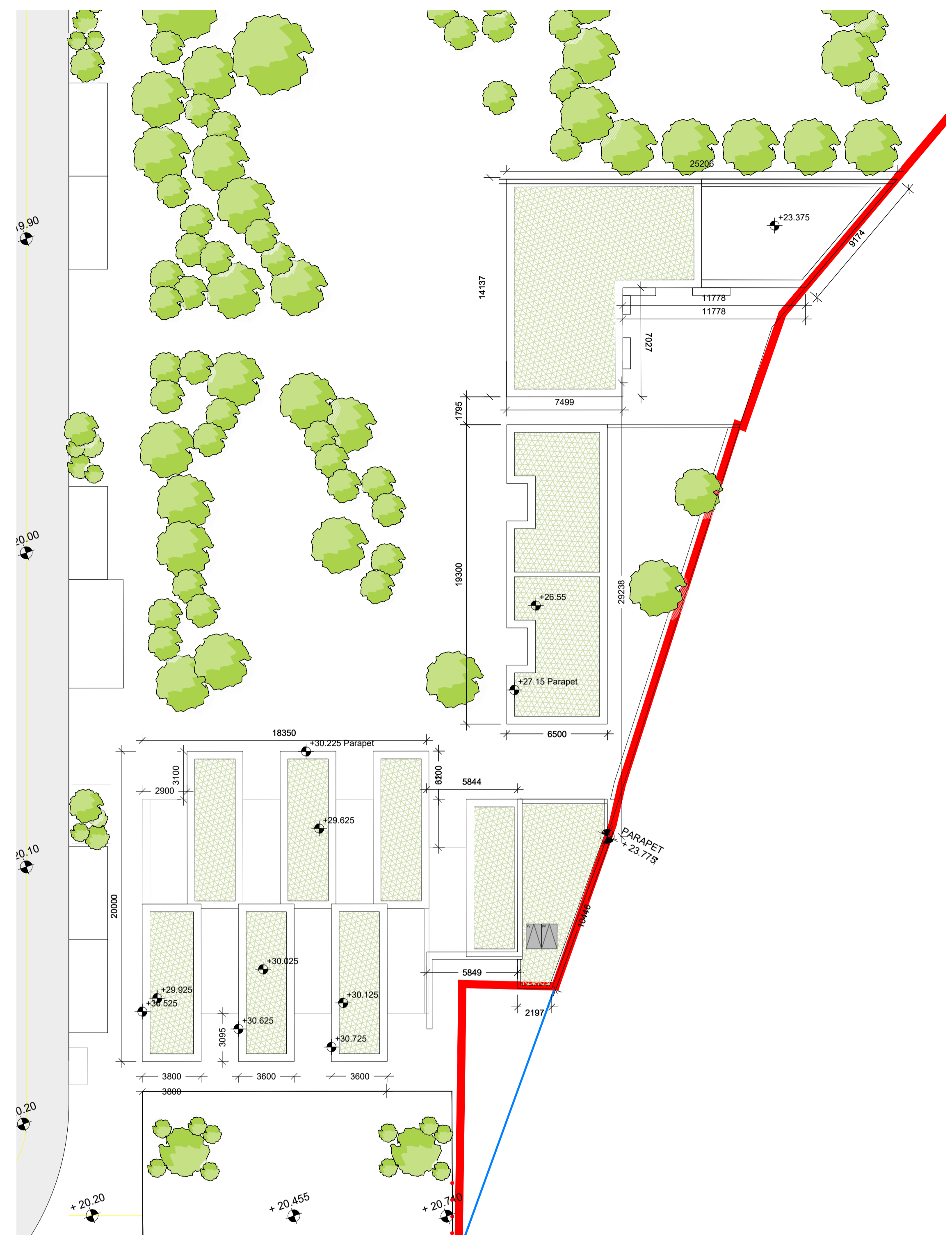
04 PL1400 PW4 ROOF FLOOR PLAN SCALE 1:200