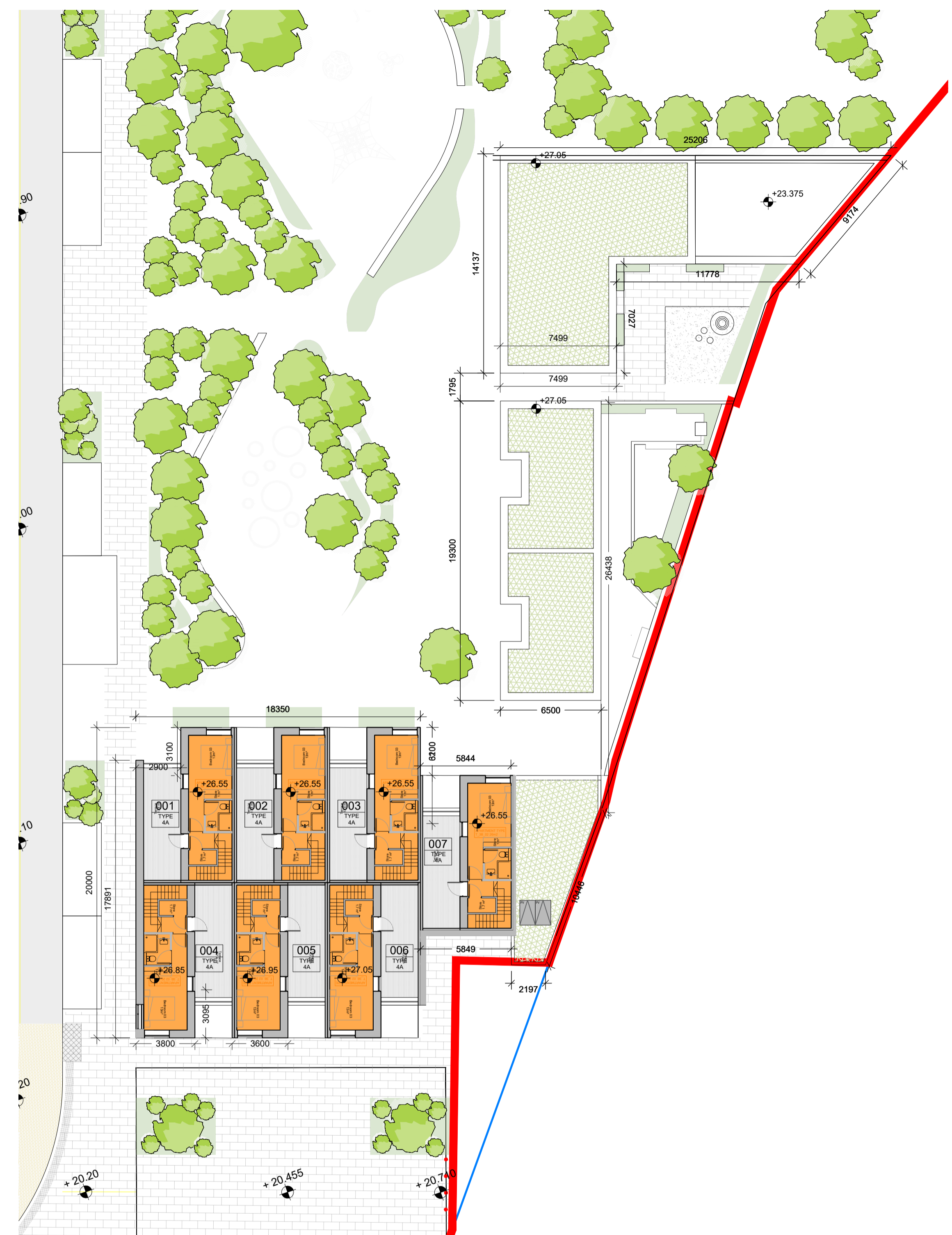
03 PL1400 PW4 SECOND FLOOR PLAN SCALE 1:200